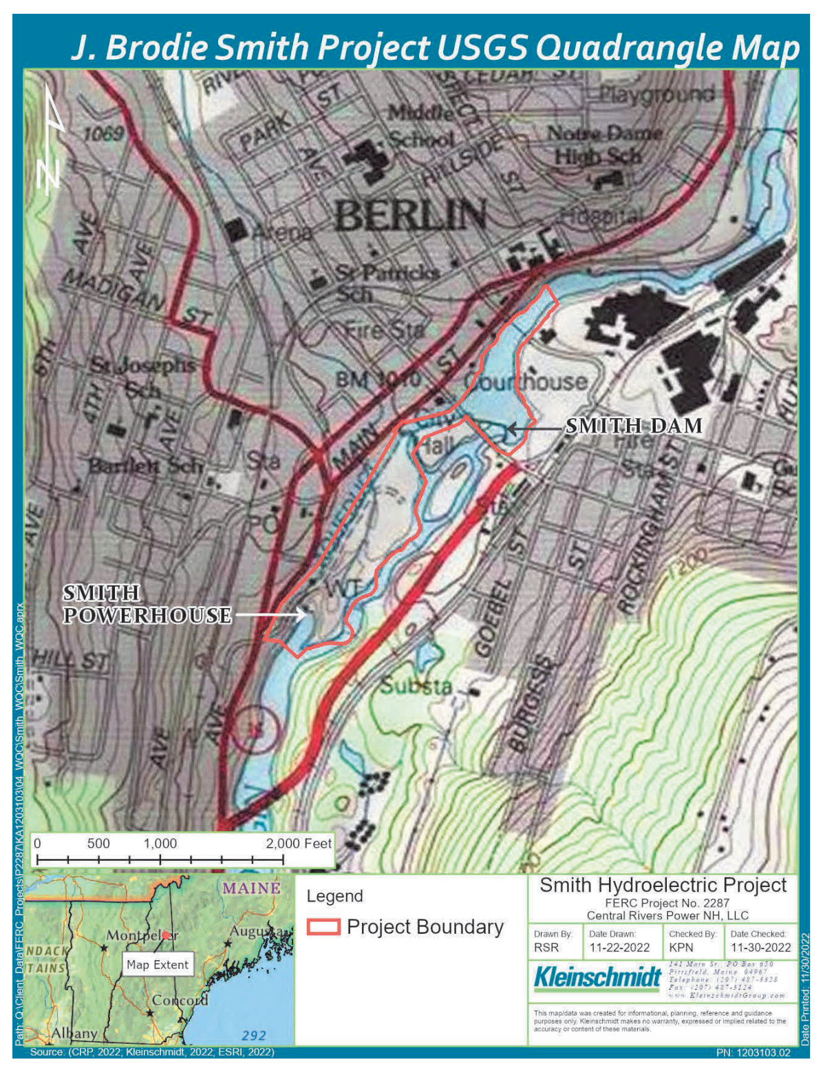
Figure 1. USGS Quadrangle Map of the J. Brodie Smith Project area.

A copy of the final complete federal permit application or federal license application, including the federal permit, license, or project number.