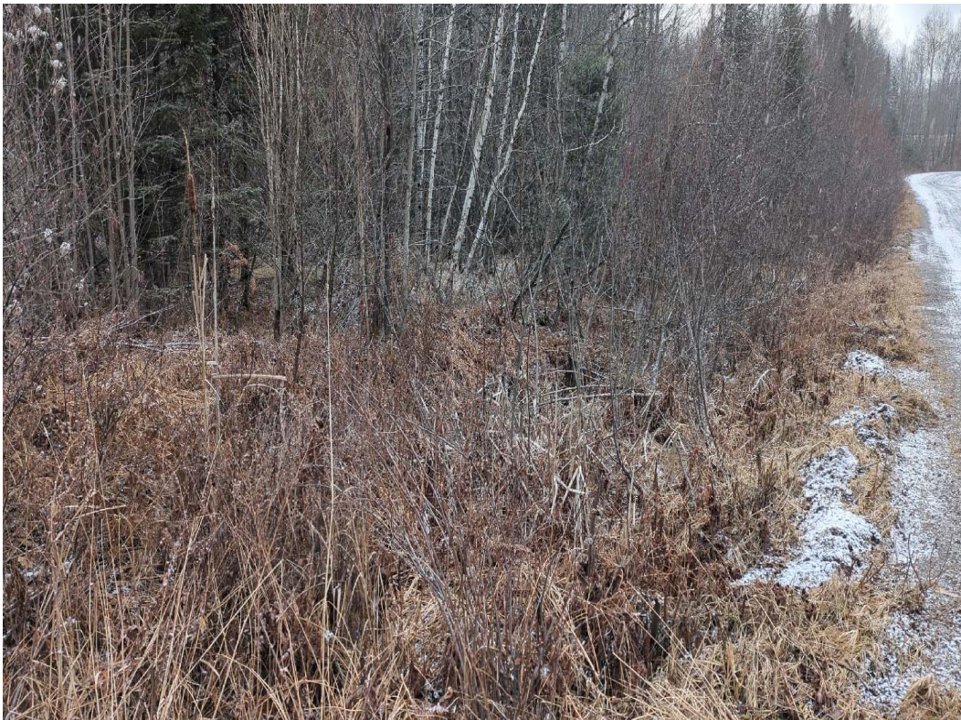
Photo 202. Location Number: 147 | Impact Areas: 23-6 and 23-7 | Capture Date: 1/4/2024