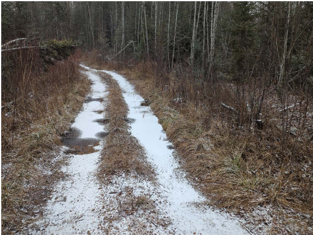
Photo 164. Location Number: 123 | Impact Areas: 22-14 and 22-15 | Capture Date: 1/4/2024