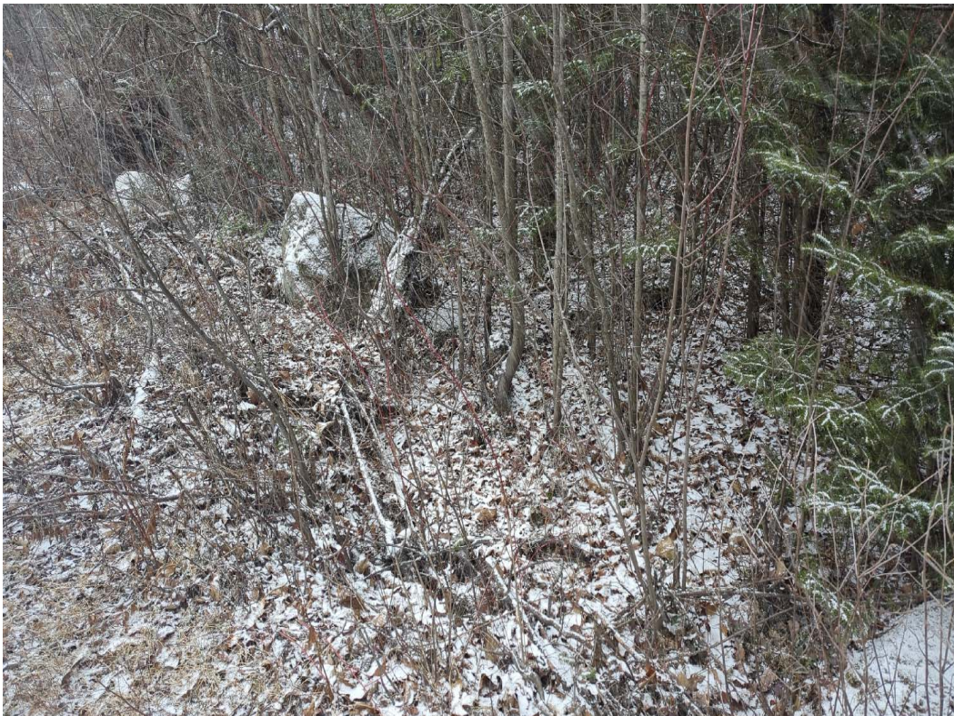
Photo 162. Location Number: 122 | Impact Areas: 22-13 | Capture Date: 1/4/2024