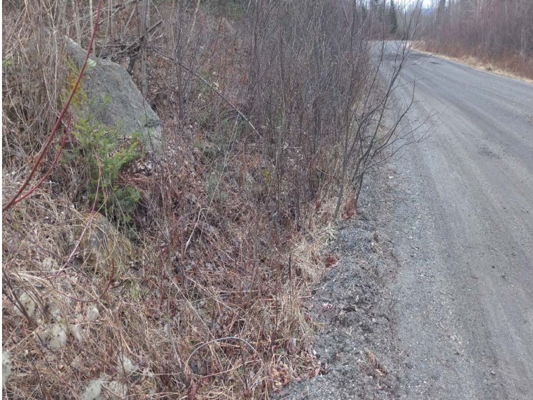
Photo 169. Location Number: 125 | Impact Areas: 22-16 | Capture Date: 1/3/2024