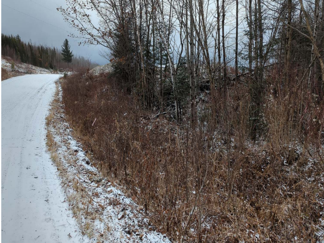
Photo 217. Location Number: 151 | Impact Areas: 23-7 | Capture Date: 1/4/2024