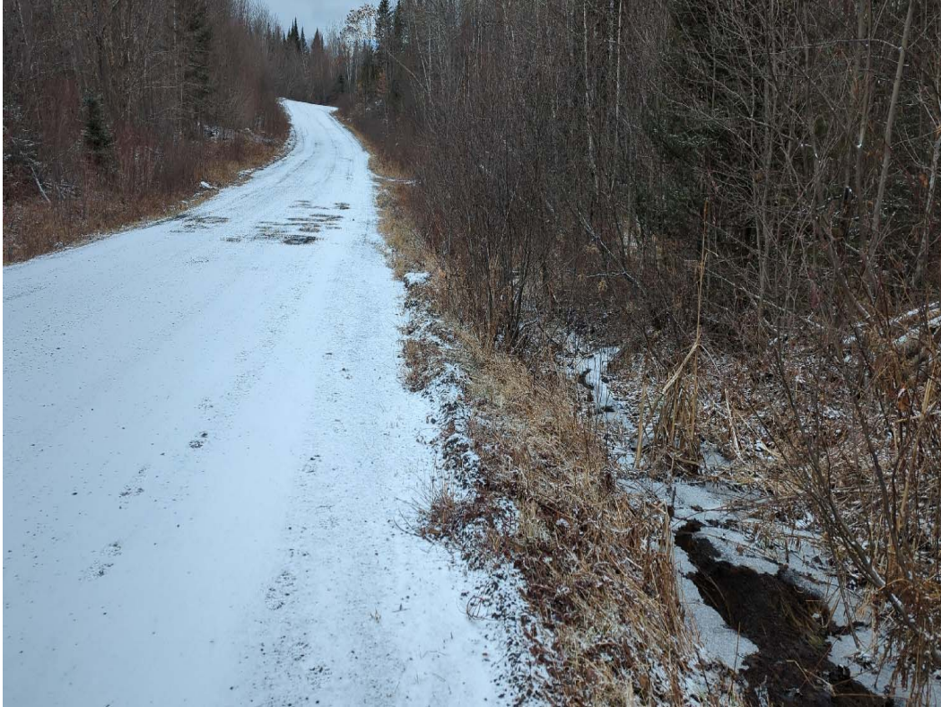
Photo 211. Location Number: 149 | Impact Areas: 23-6 and 23-7 | Capture Date: 1/4/2024