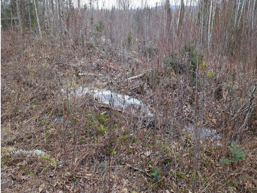
Photo 173. Location Number: 128 | Impact Areas: 22-18 | Capture Date: 1/3/2024