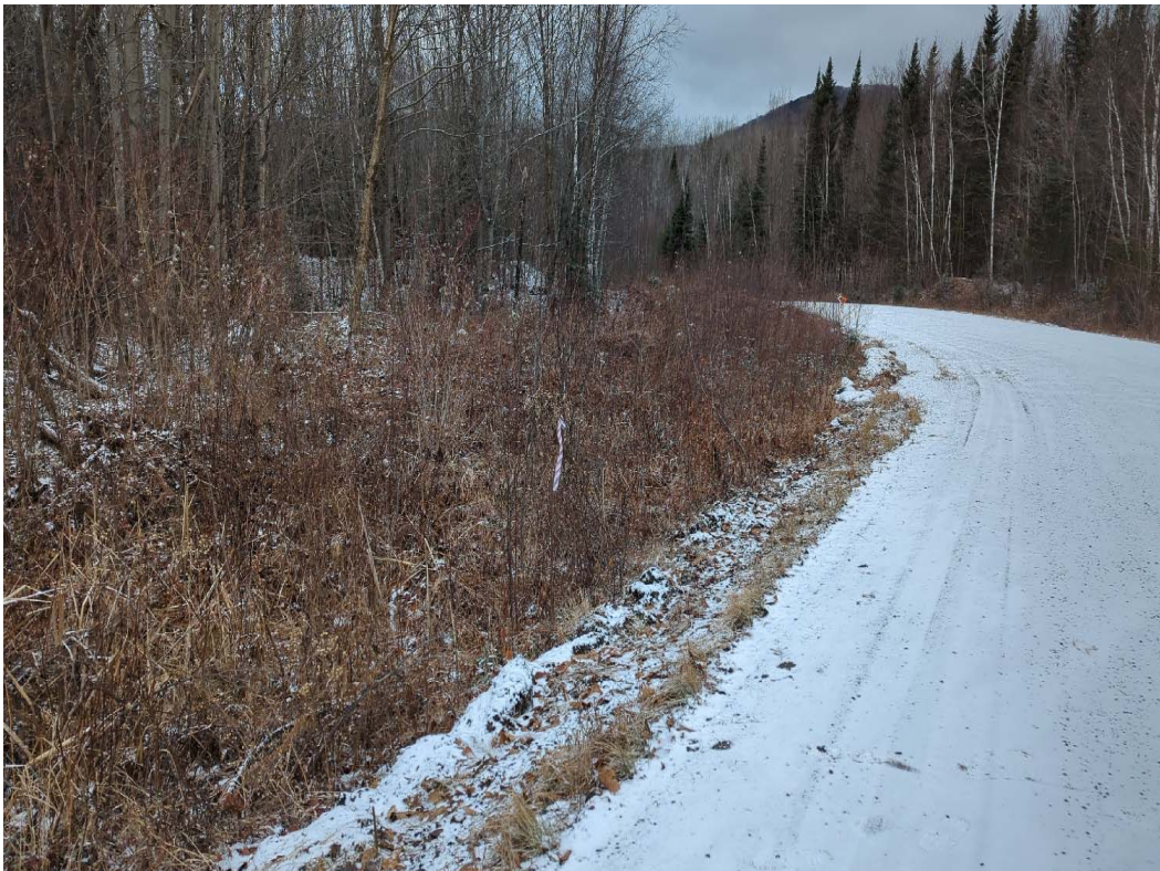
Photo 216. Location Number: 151 | Impact Areas: 23-7 | Capture Date: 1/4/2024