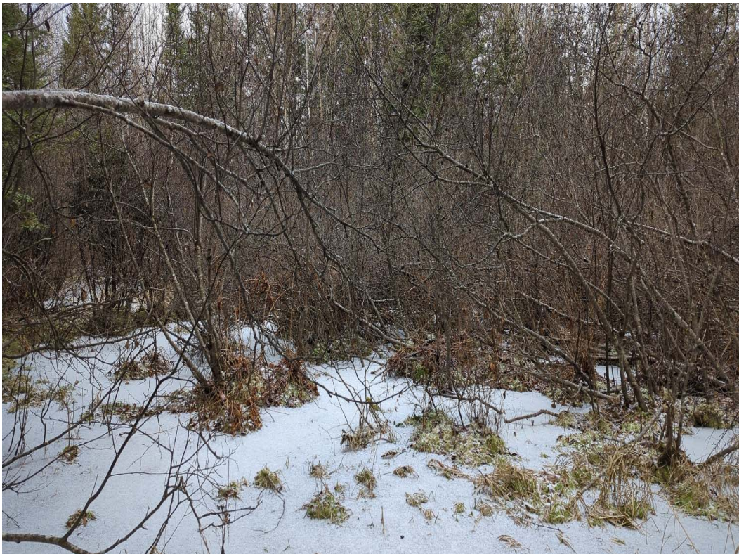
Photo 186. Location Number: 137 | Impact Areas: 22-25 | Capture Date: 1/4/2024