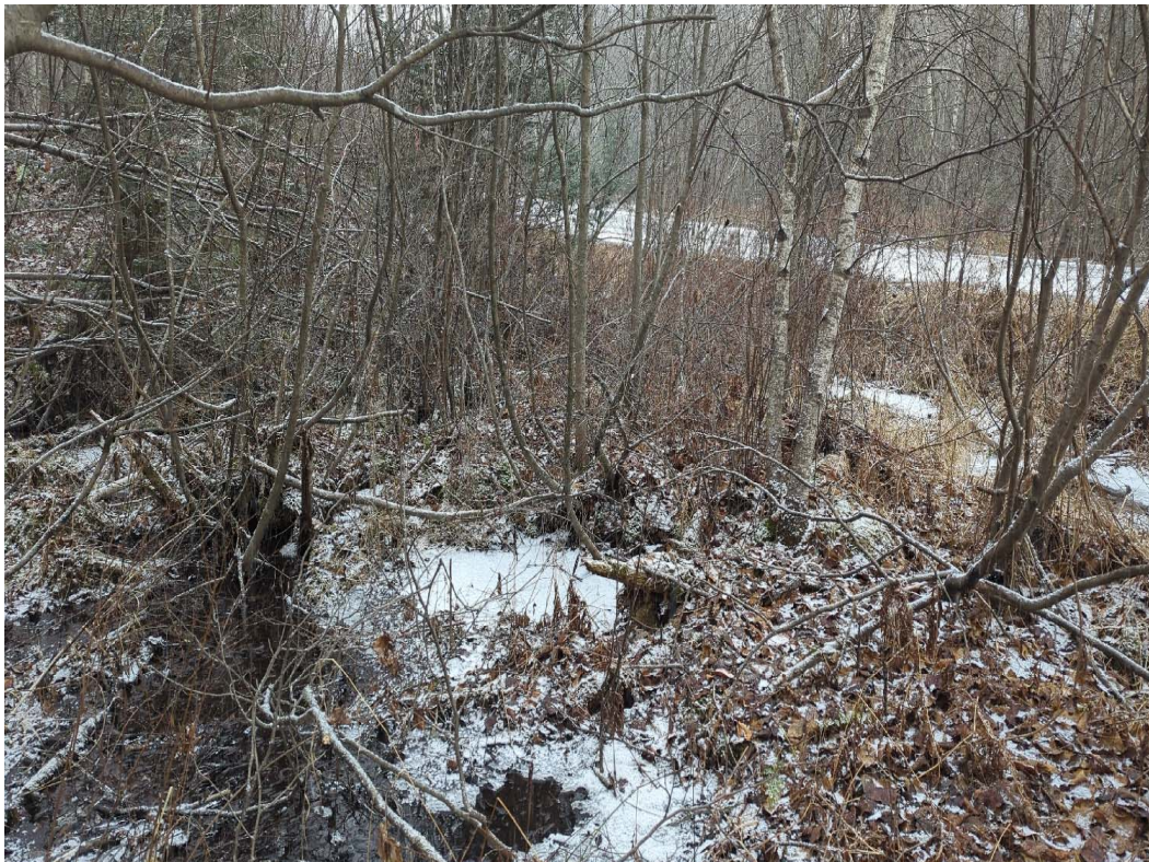
Photo 214. Location Number: 150 | Impact Areas: 23-6A | Capture Date: 1/4/2024