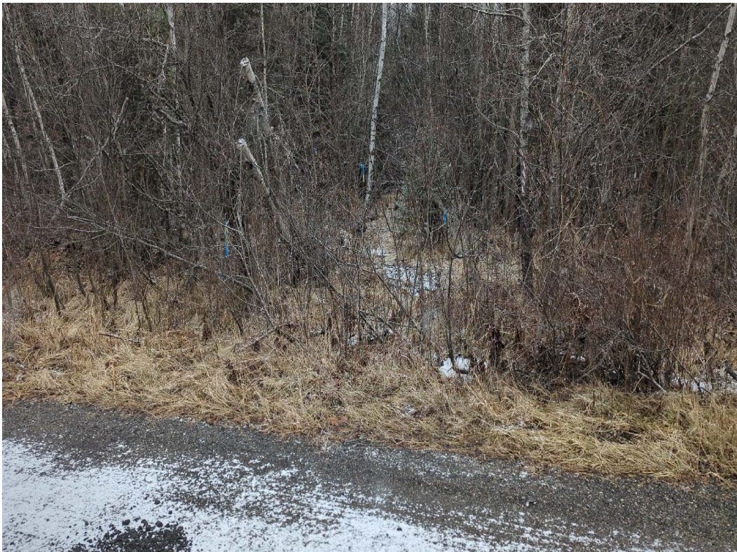
Photo 204. Location Number: 148 | Impact Areas: 23-6, 23-6a, 23-11, 23-12, and 23-13 | Capture Date: 1/4/2024