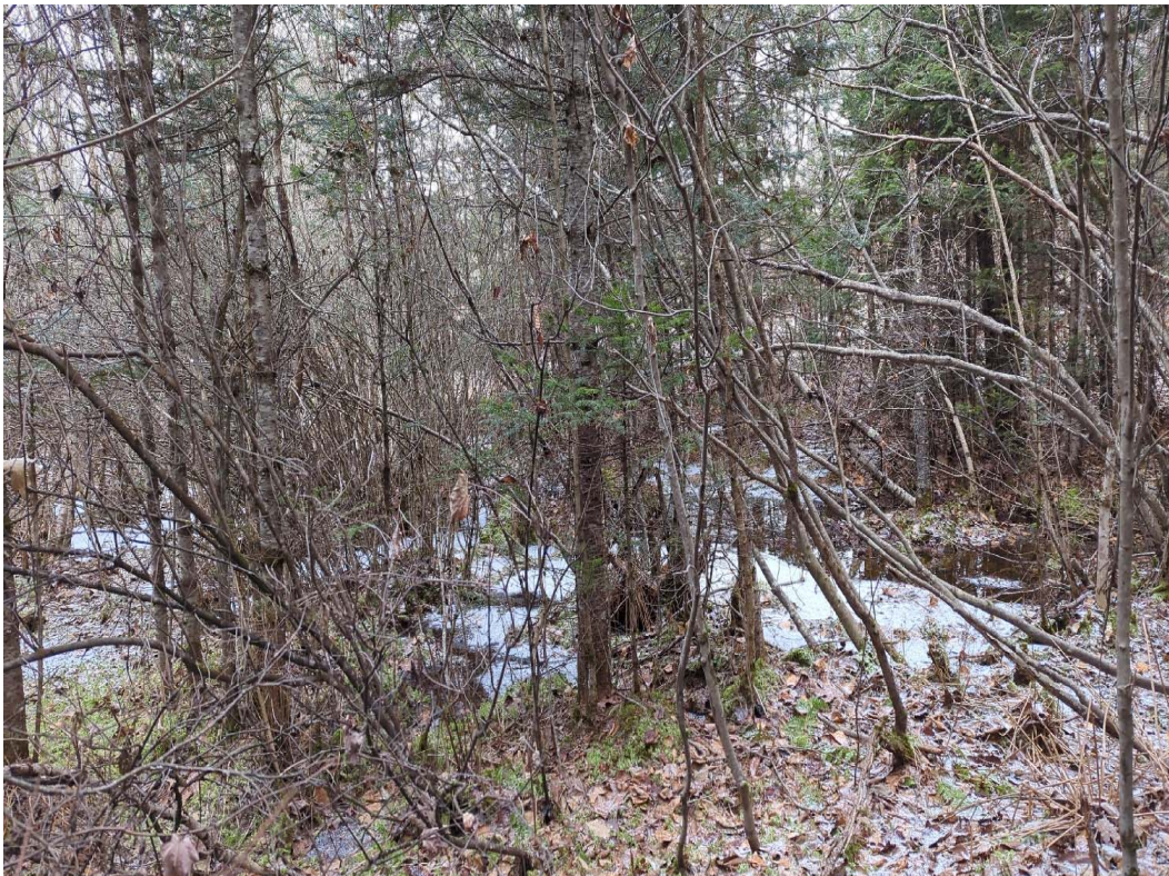
Photo 190. Location Number: 139 | Impact Areas: 22-25 | Capture Date: 1/4/2024