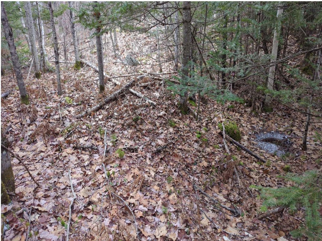
Photo 174. Location Number: 129 | Impact Areas: 22-19 | Capture Date: 1/3/2024