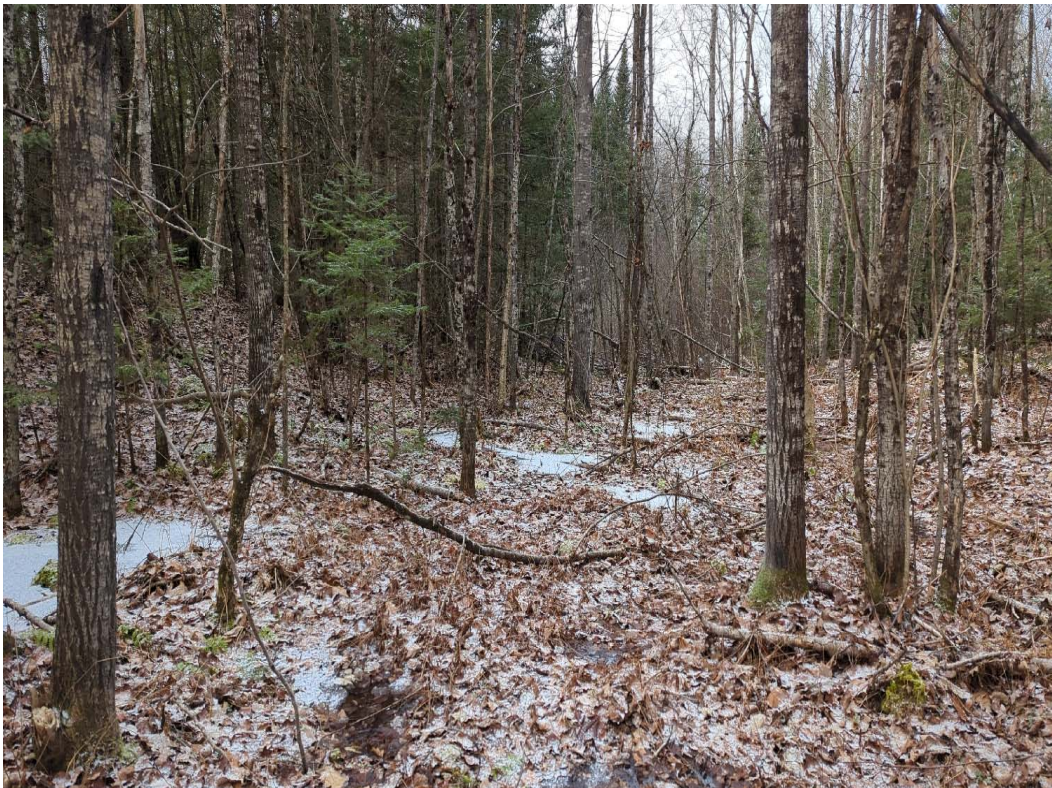
Photo 184. Location Number: 136 | Impact Areas: 22-24 | Capture Date: 1/4/2024