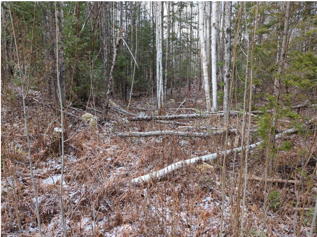
Photo 178. Location Number: 132 | Impact Areas: 22-21 | Capture Date: 1/4/2024