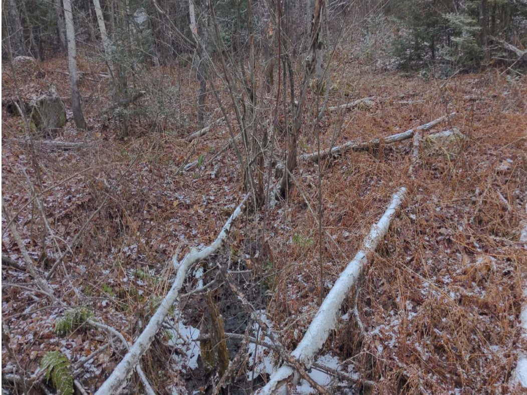
Photo 201. Location Number: 146 | Impact Areas: 23-5 | Capture Date: 1/4/2024