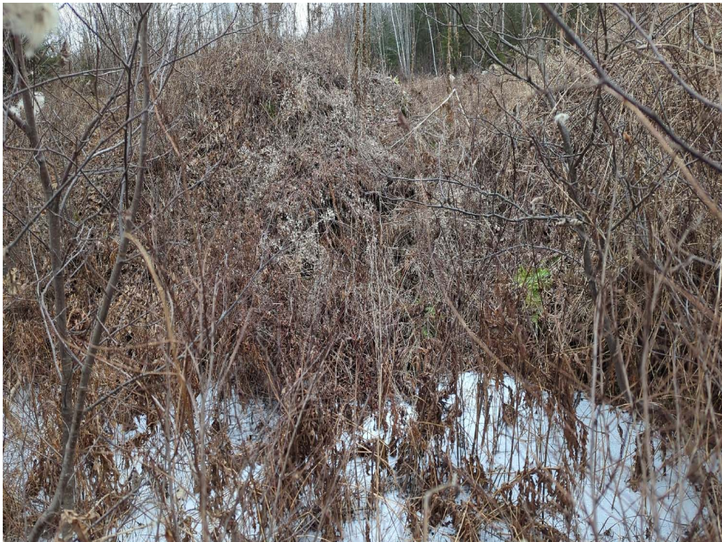
Photo 170. Location Number: 126 | Impact Areas: 22-16 | Capture Date: 1/3/2024