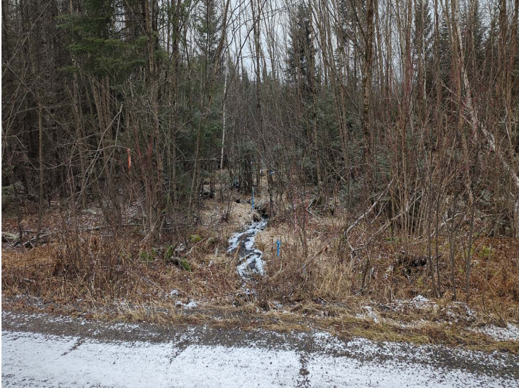
Photo 205. Location Number: 148 | Impact Areas: 23-6, 23-6a, 23-11, 23-12, and 23-13 | Capture Date: 1/4/2024