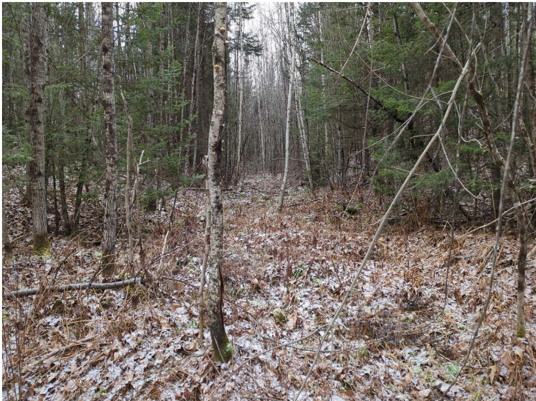
Photo 182. Location Number: 134 | Impact Areas: 22-22 | Capture Date: 1/4/2024