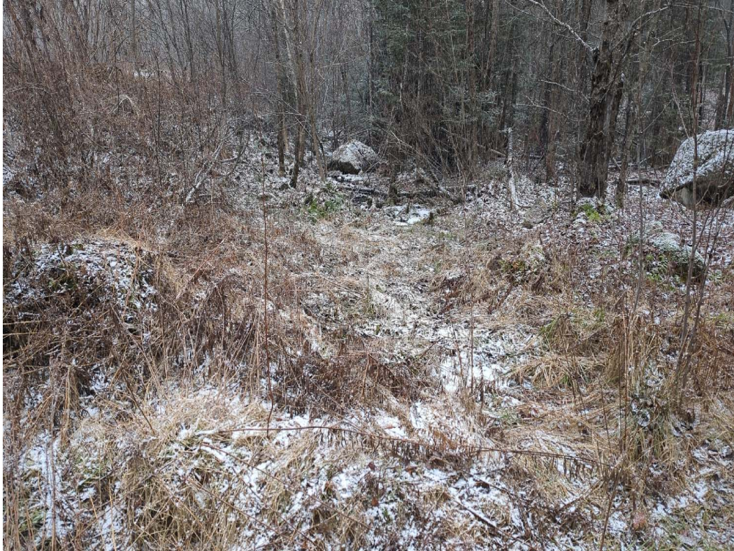
Photo 195. Location Number: 143 | Impact Areas: 23-1 and 23-2 | Capture Date: 1/4/2024