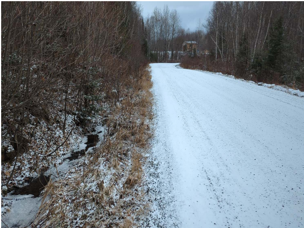
Photo 210. Location Number: 149 | Impact Areas: 23-6 and 23-7 | Capture Date: 1/4/2024