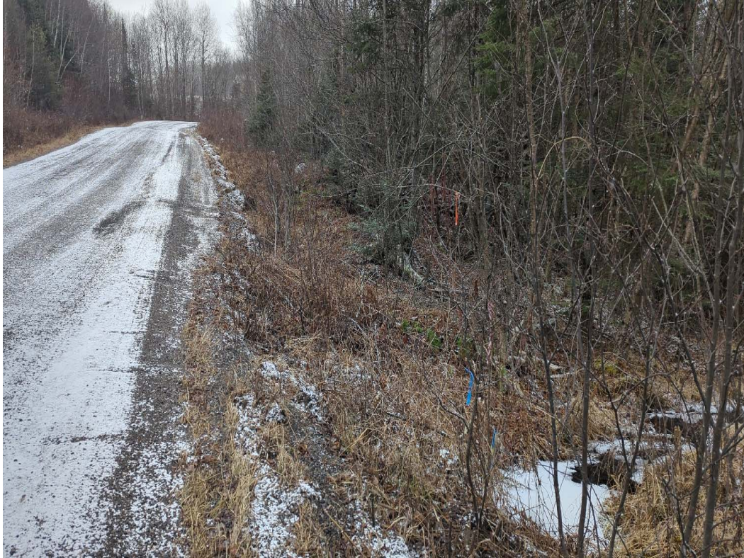
Photo 209. Location Number: 148 | Impact Areas: 23-6, 23-6a, 23-11, 23-12, and 23-13 | Capture Date: 1/4/2024