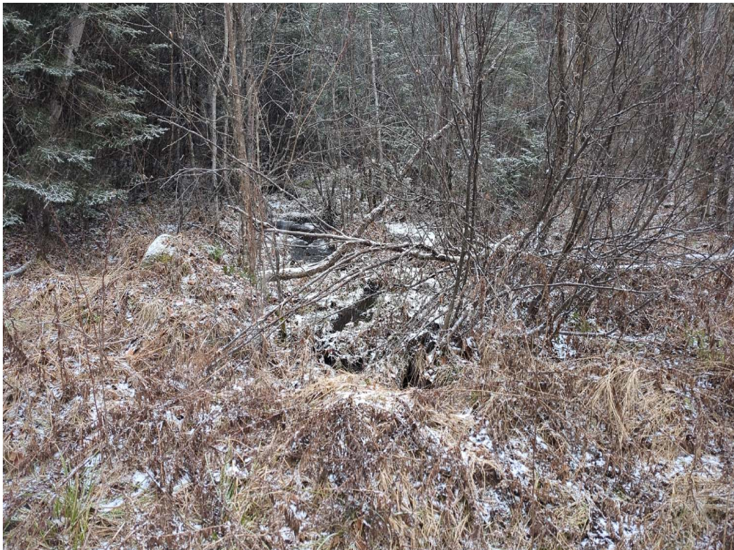
Photo 196. Location Number: 143 | Impact Areas: 23-1 and 23-2 | Capture Date: 1/4/2024