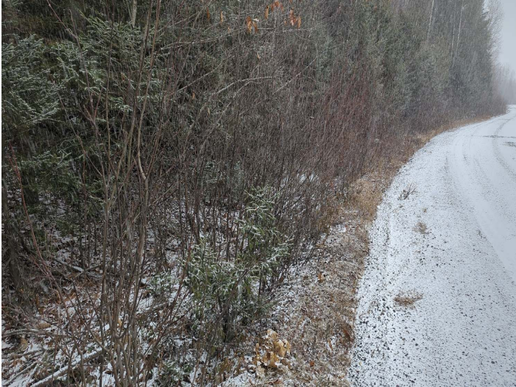
Photo 161. Location Number: 122 | Impact Areas: 22-13 | Capture Date: 1/4/2024