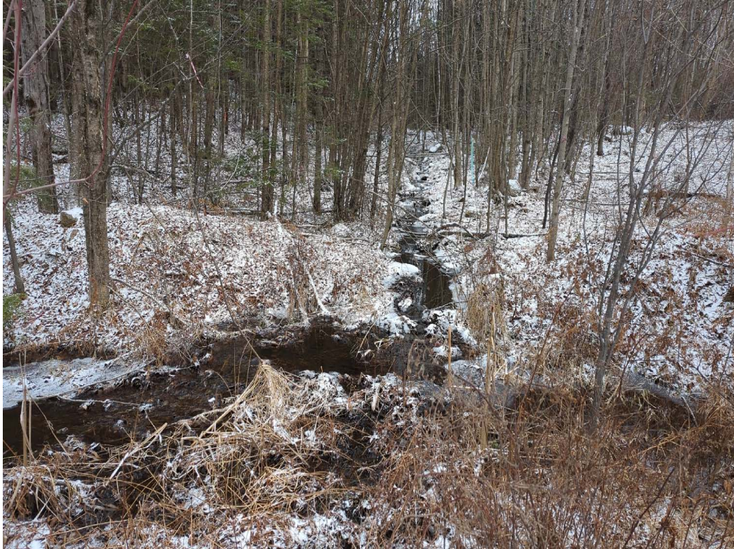
Photo 219. Location Number: 153 | Impact Areas: 23-7, 23-7A, and 23-8 | Capture Date: 1/4/2024