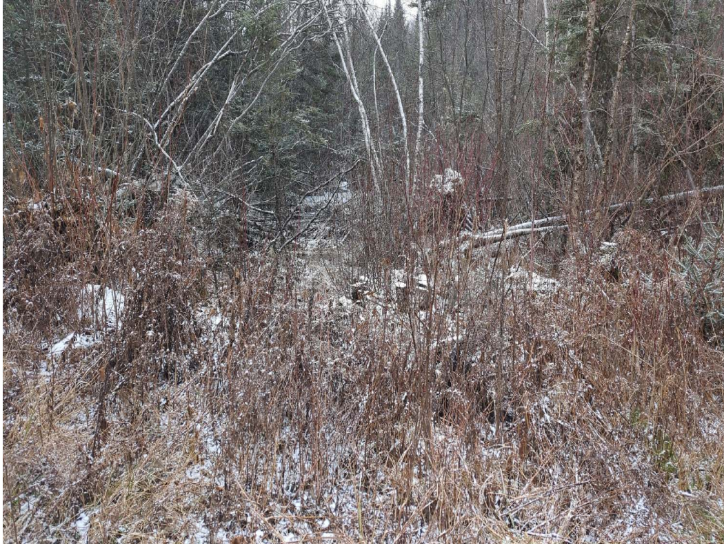
Photo 163. Location Number: 123 | Impact Areas: 22-14 and 22-15 | Capture Date: 1/4/2024