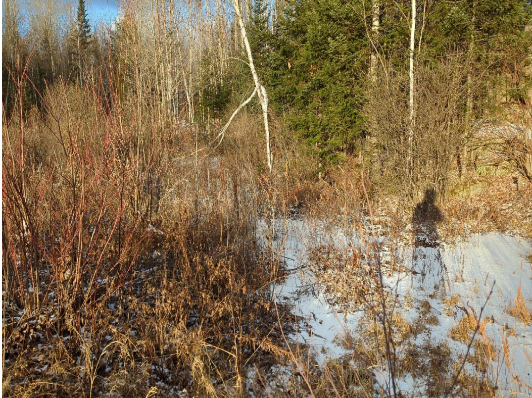
Photo 171. Location Number: 127 | Impact Areas: 22-17 | Capture Date: 1/4/2024