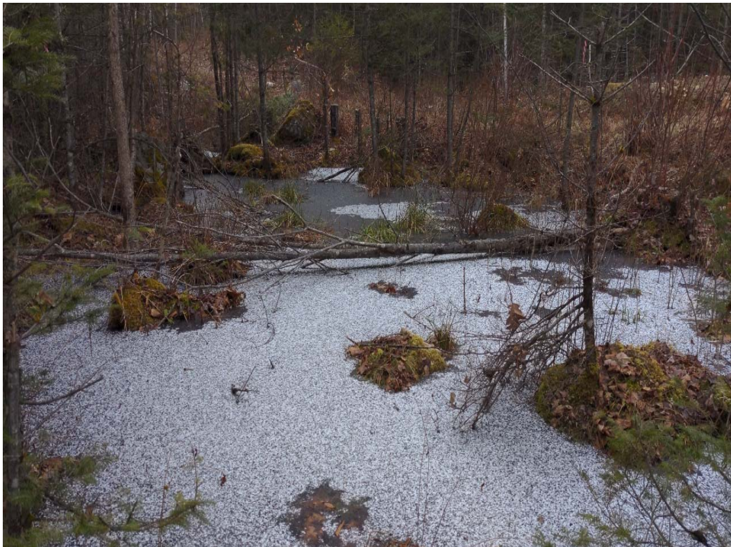
Photo 192. Location Number: 141 | Impact Areas: 22-27 (VP-4) | Capture Date: 1/3/2024