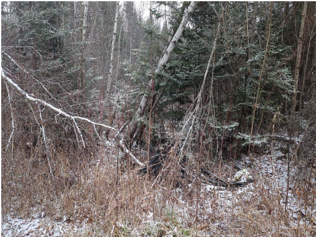
Photo 166. Location Number: 124 | Impact Areas: 22-14 and 22-15 | Capture Date: 1/4/2024