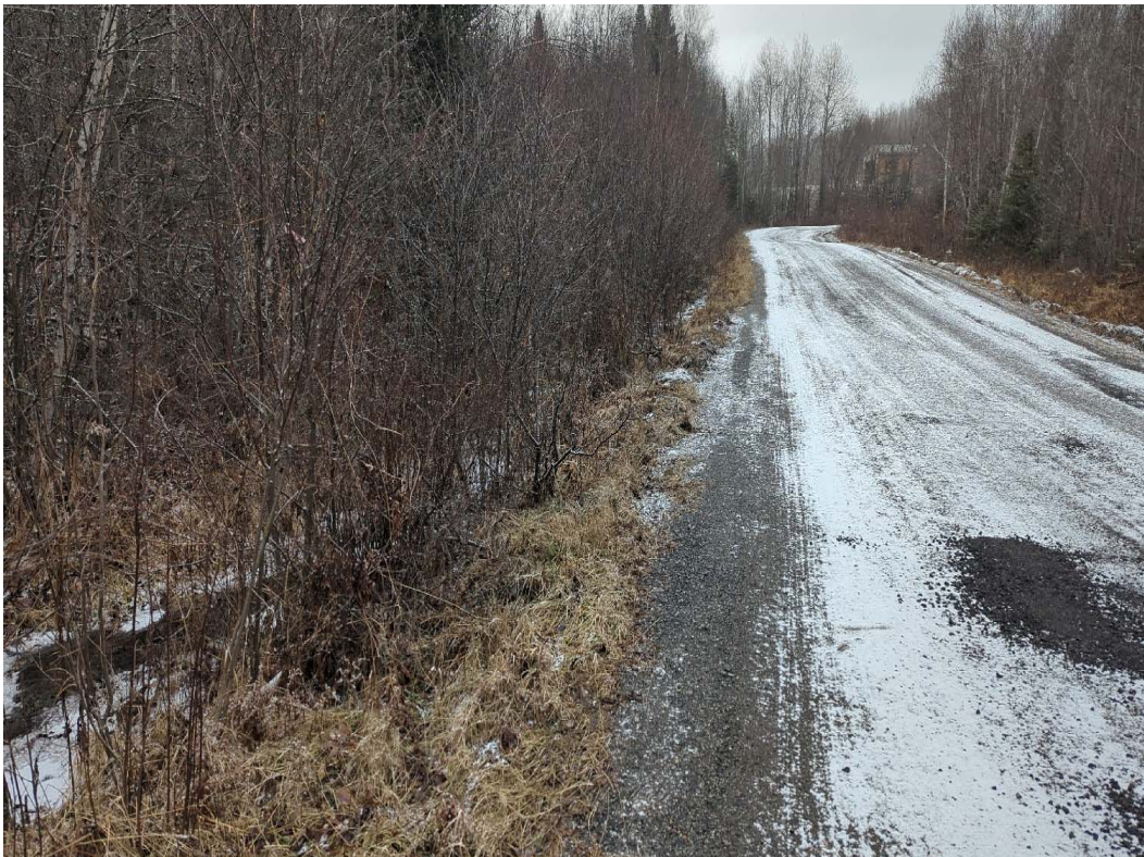
Photo 206. Location Number: 148 | Impact Areas: 23-6, 23-6a, 23-11, 23-12, and 23-13 | Capture Date: 1/4/2024