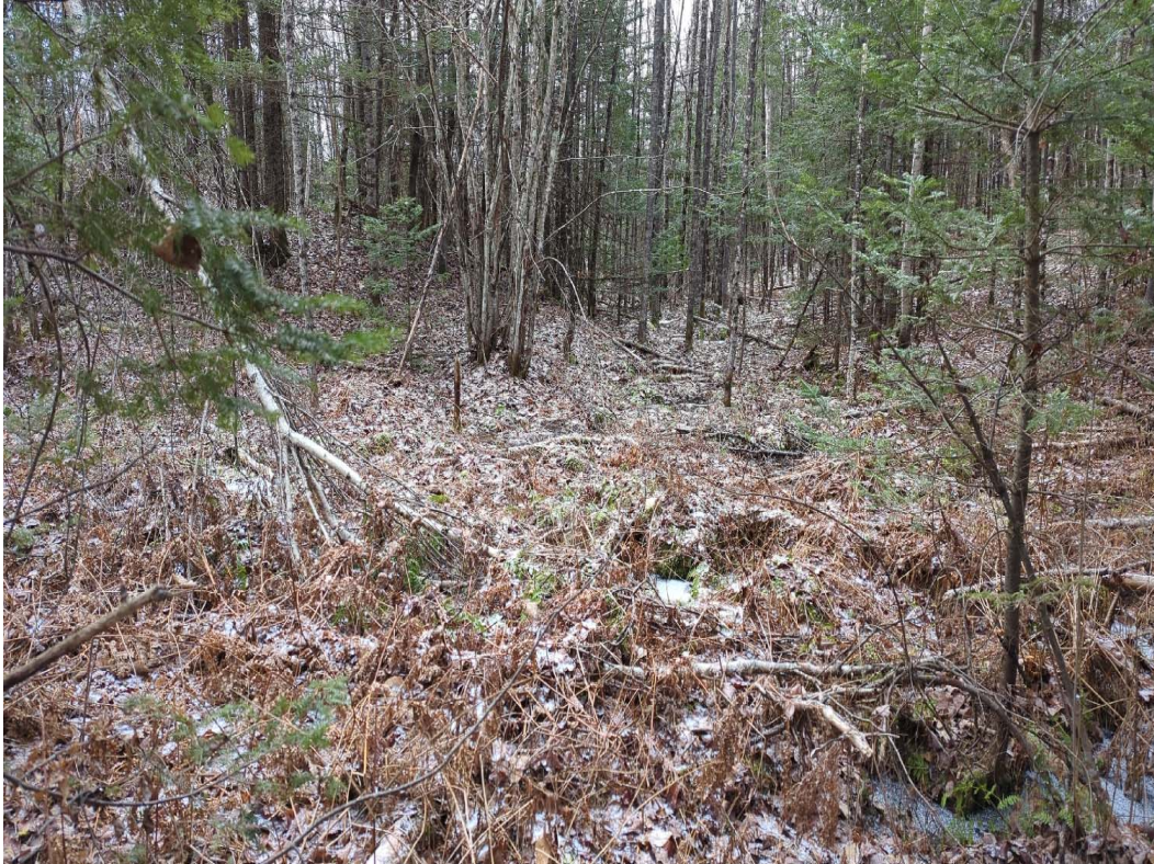
Photo 183. Location Number: 135 | Impact Areas: 22-23 | Capture Date: 1/4/2024