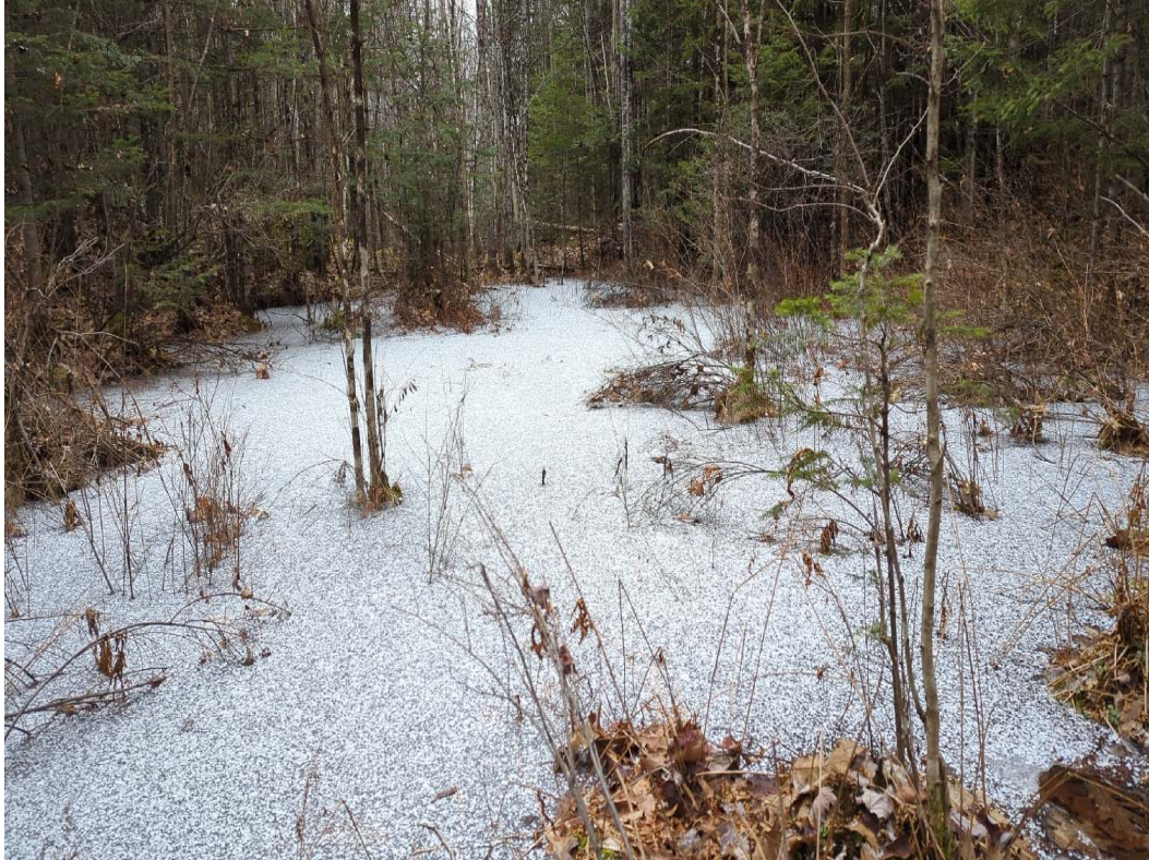
Photo 191. Location Number: 140 | Impact Areas: 22-26 (VP-5) | Capture Date: 1/3/2024