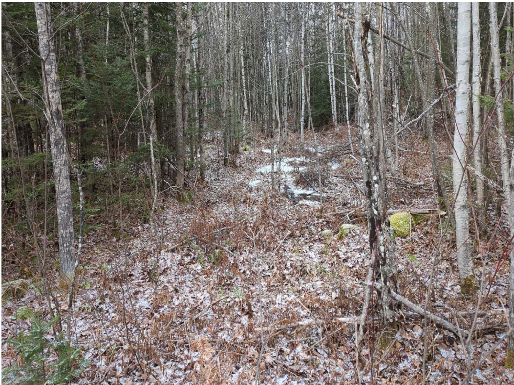
Photo 180. Location Number: 133 | Impact Areas: 22-22 | Capture Date: 1/4/2024