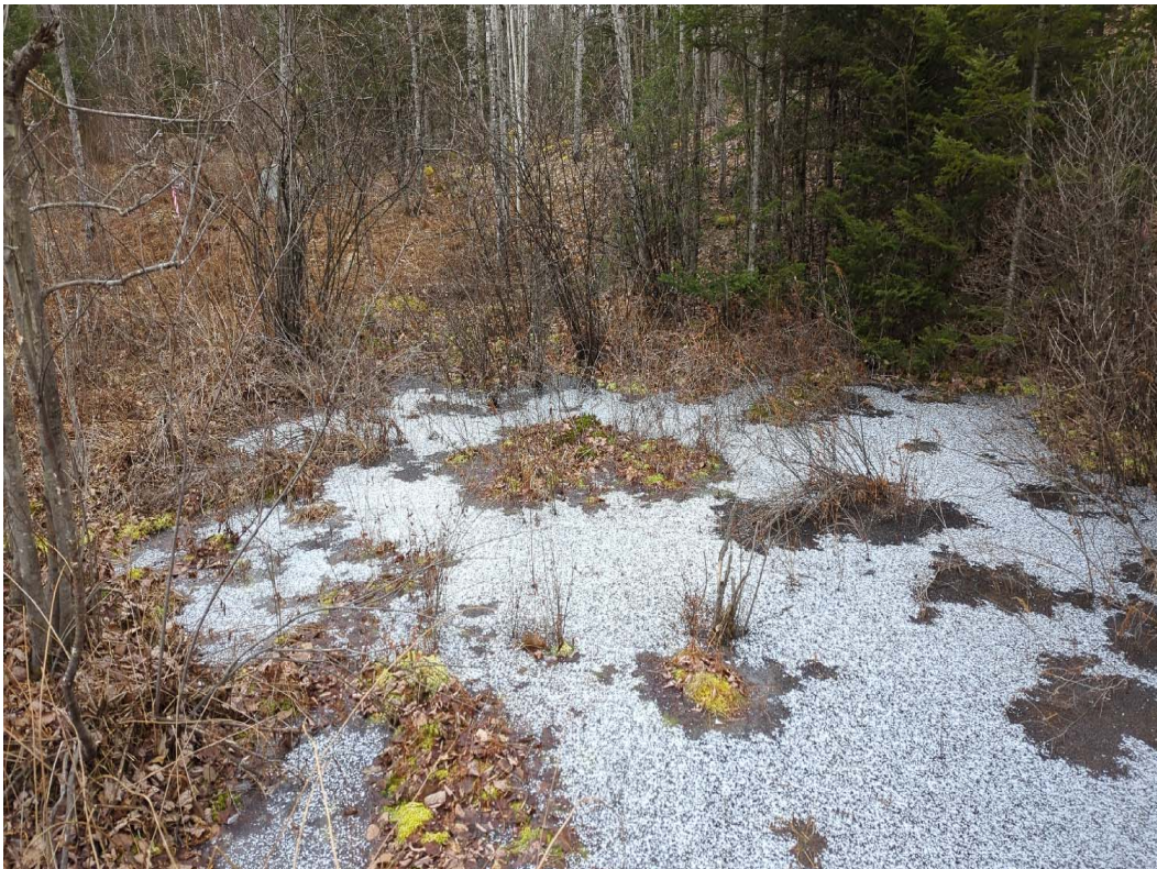
Photo 194. Location Number: 142 | Impact Areas: 22-28 (VP-3) | Capture Date: 1/3/2024