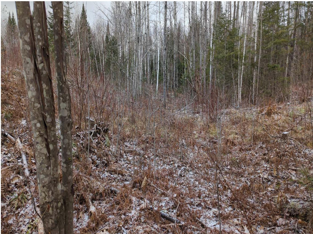
Photo 176. Location Number: 131 | Impact Areas: 22-20 | Capture Date: 1/4/2024