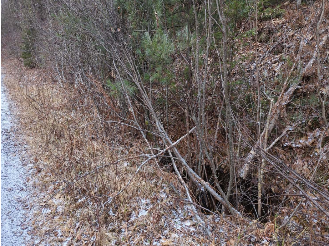
Photo 199. Location Number: 145 | Impact Areas: 23-4 | Capture Date: 1/4/2024