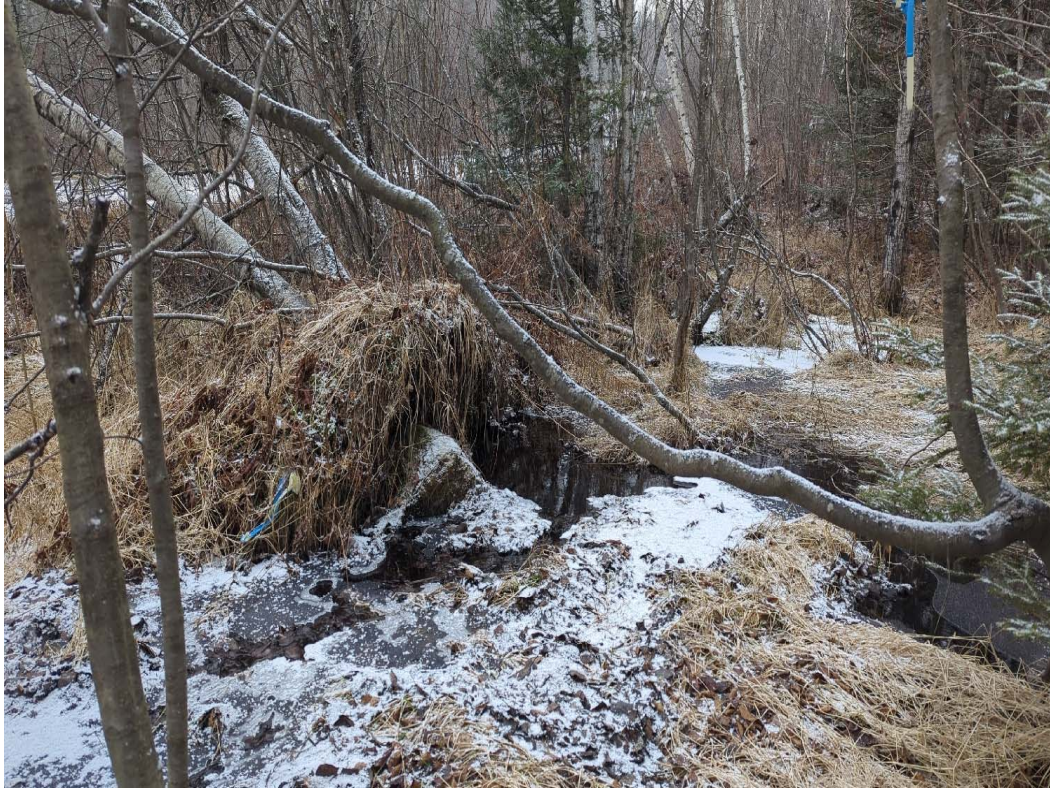
Photo 213. Location Number: 150 | Impact Areas: 23-6A | Capture Date: 1/4/2024