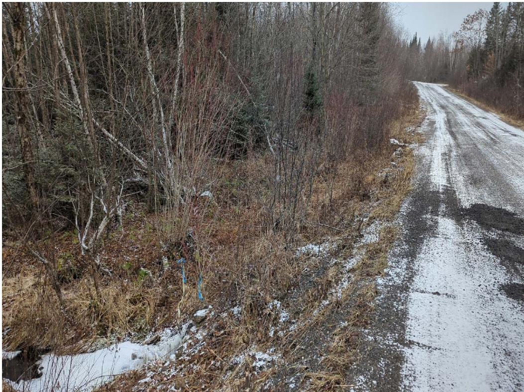
Photo 208. Location Number: 148 | Impact Areas: 23-6, 23-6a, 23-11, 23-12, and 23-13 | Capture Date: 1/4/2024