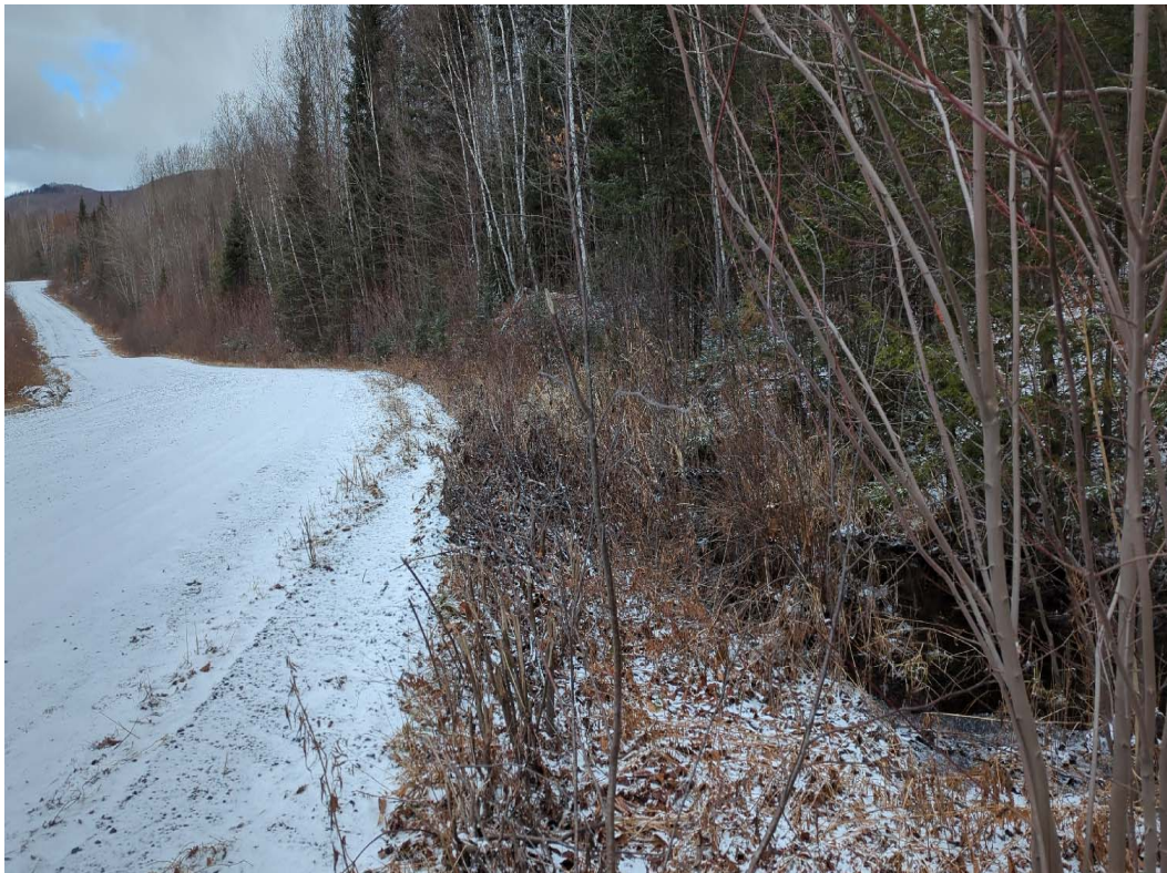
Photo 220. Location Number: 153 | Impact Areas: 23-7, 23-7A, and 23-8 | Capture Date: 1/4/2024