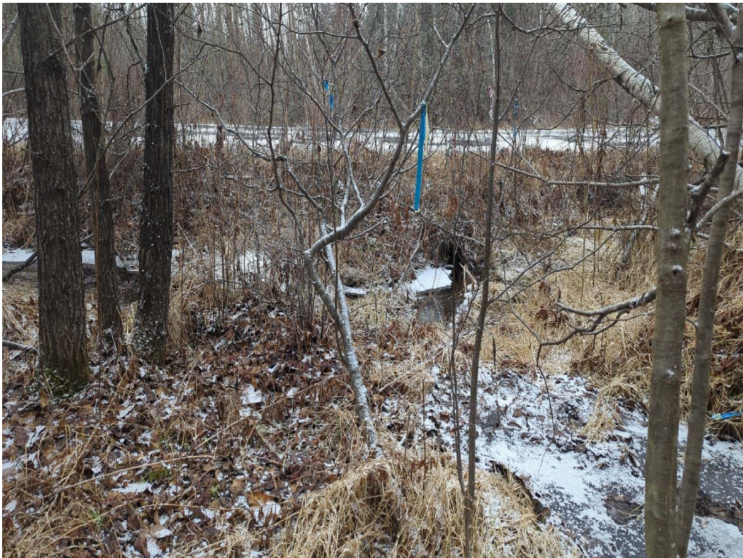
Photo 212. Location Number: 150 | Impact Areas: 23-6A | Capture Date: 1/4/2024