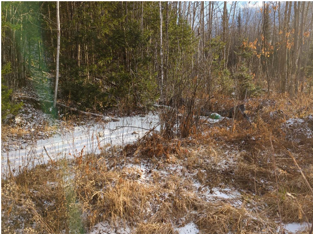
Photo 172. Location Number: 127 | Impact Areas: 22-17 | Capture Date: 1/4/2024