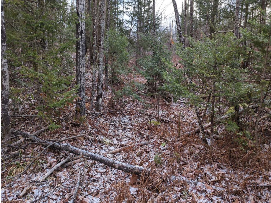
Photo 177. Location Number: 131 | Impact Areas: 22-20 | Capture Date: 1/4/2024