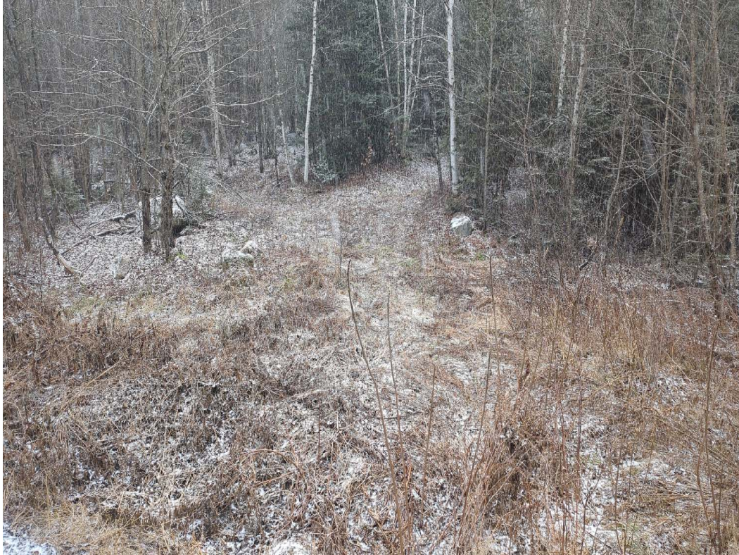
Photo 197. Location Number: 143 | Impact Areas: 23-1 and 23-2 | Capture Date: 1/4/2024