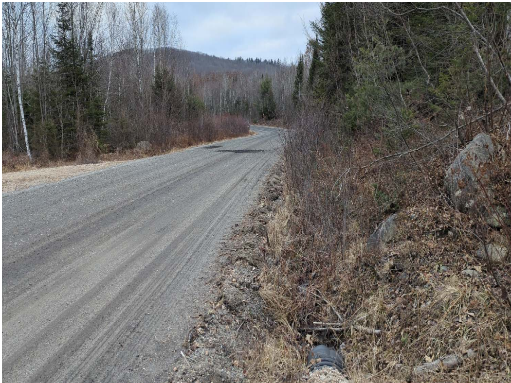
Photo 168. Location Number: 125 | Impact Areas: 22-16 | Capture Date: 1/3/2024