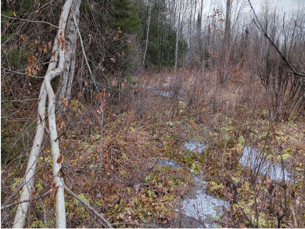
Photo 193. Location Number: 142 | Impact Areas: 22-28 (VP-3) | Capture Date: 1/3/2024