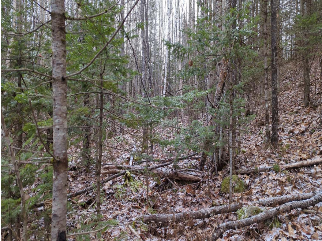
Photo 187. Location Number: 138 | Impact Areas: 22-25 | Capture Date: 1/4/2024