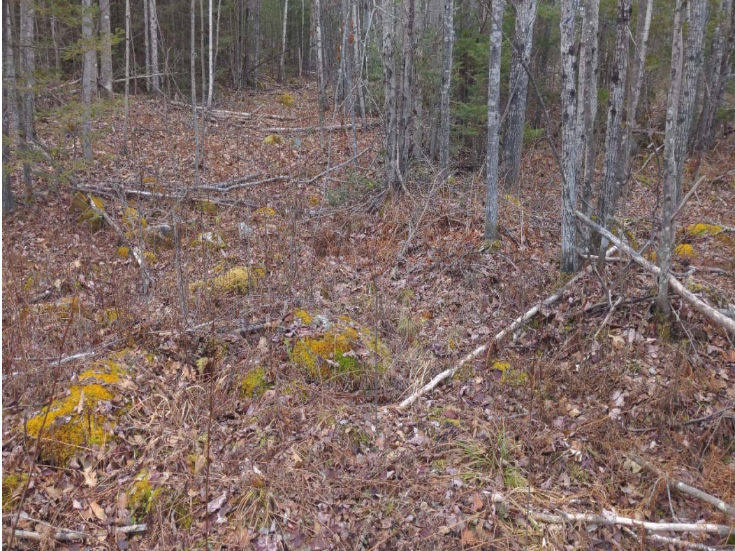
Photo 175. Location Number: 130 | Impact Areas: 22-20 | Capture Date: 1/3/2024