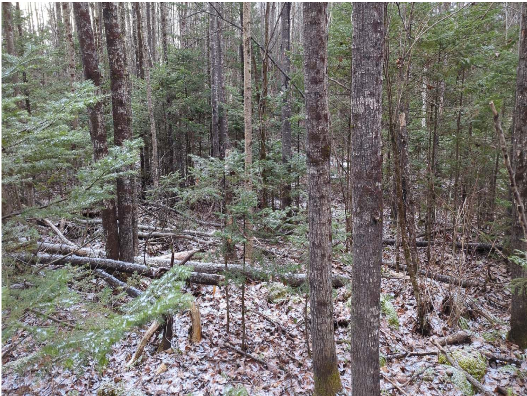
Photo 188. Location Number: 138 | Impact Areas: 22-25 | Capture Date: 1/4/2024