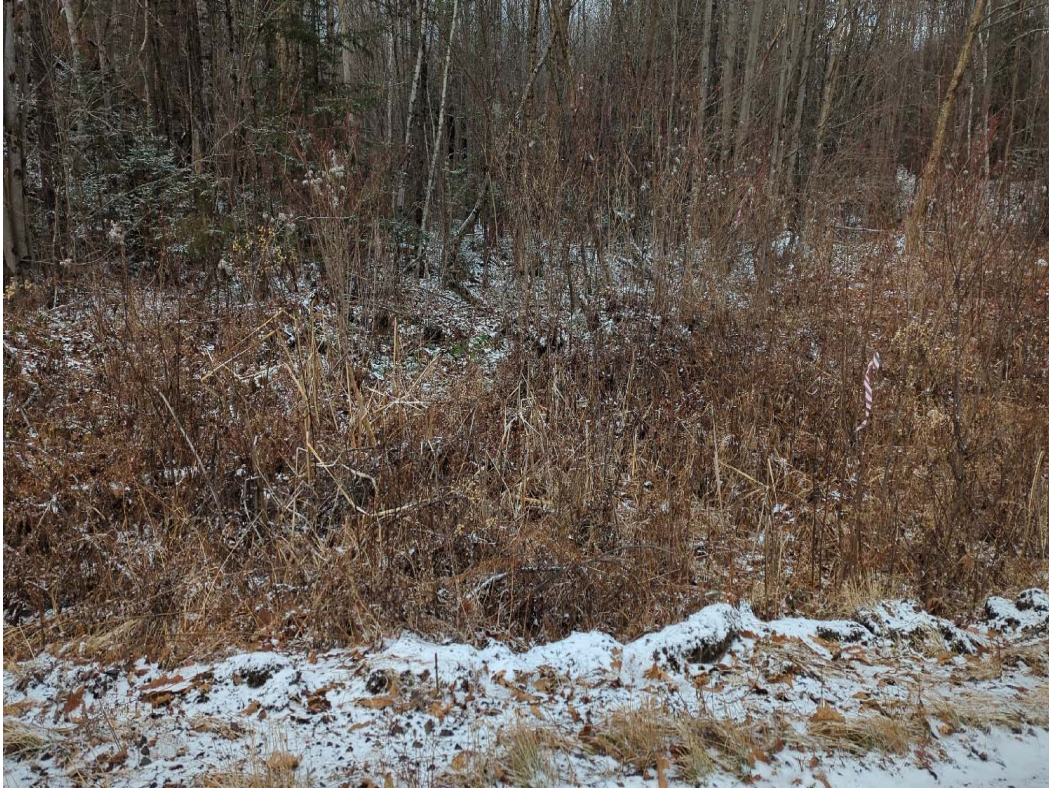
Photo 215. Location Number: 151 | Impact Areas: 23-7 | Capture Date: 1/4/2024