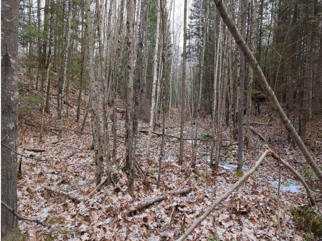
Photo 185. Location Number: 136 | Impact Areas: 22-24 | Capture Date: 1/4/2024