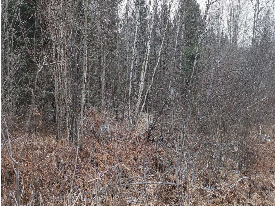
Photo 203. Location Number: 147 | Impact Areas: 23-6 and 23-7 | Capture Date: 1/4/2024