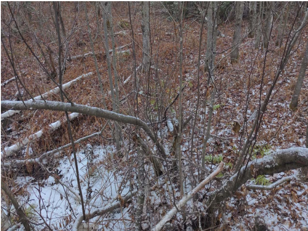
Photo 200. Location Number: 146 | Impact Areas: 23-5 | Capture Date: 1/4/2024