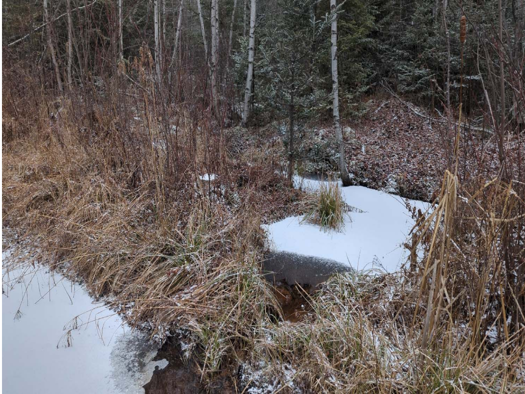
Photo 165. Location Number: 123 | Impact Areas: 22-14 and 22-15 | Capture Date: 1/4/2024