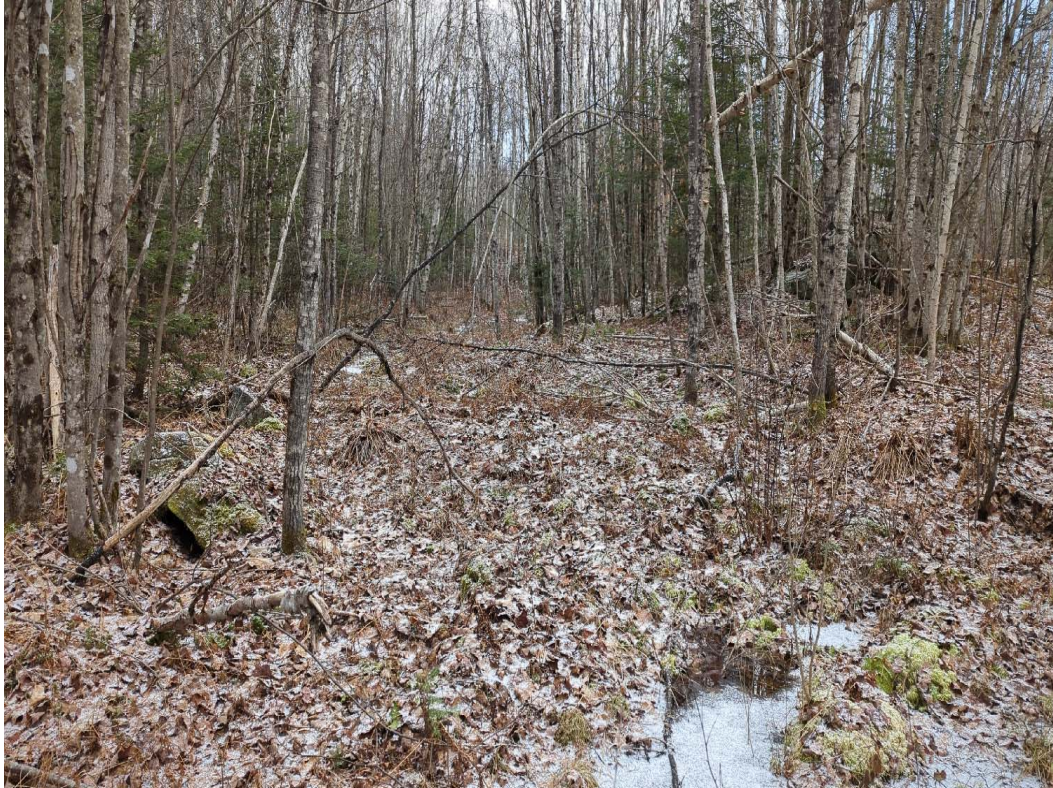
Photo 181. Location Number: 134 | Impact Areas: 22-22 | Capture Date: 1/4/2024