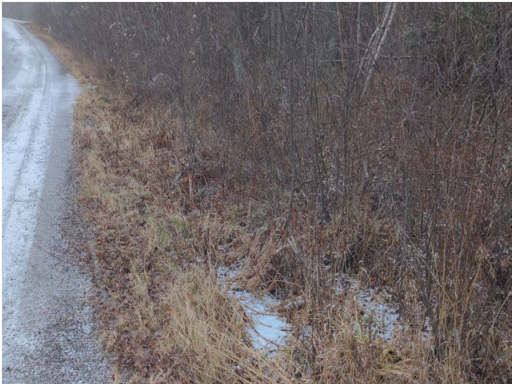
Photo 198. Location Number: 144 | Impact Areas: 23-3 | Capture Date: 1/4/2024