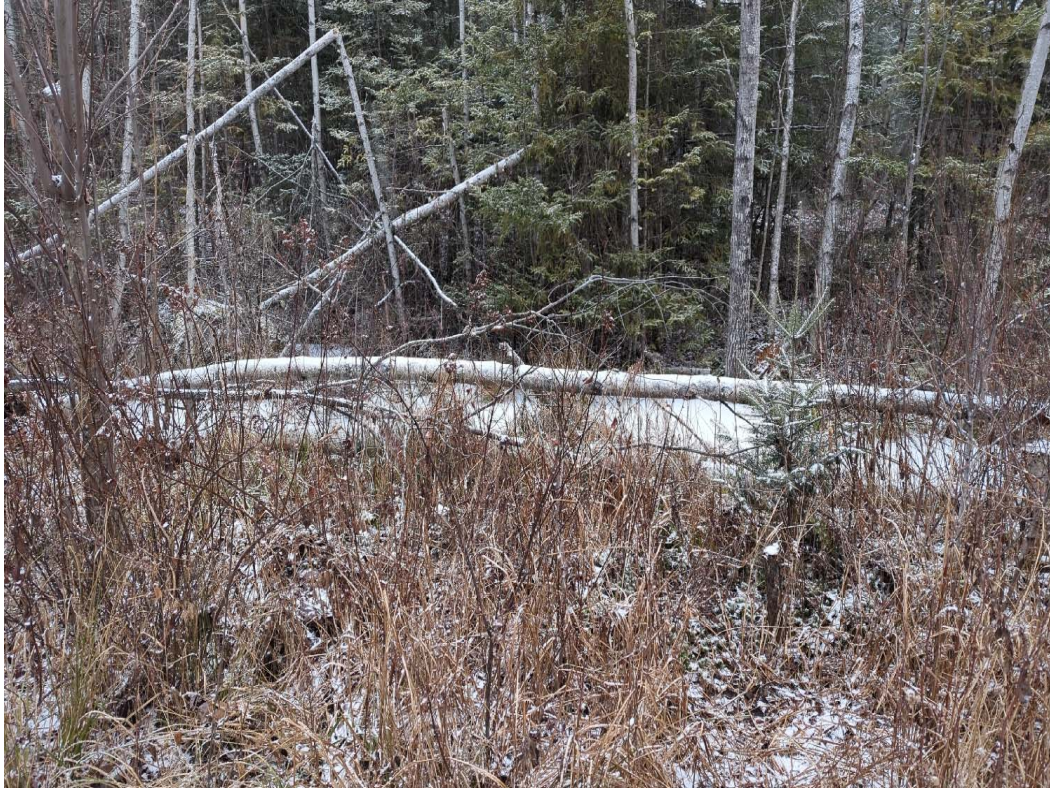
Photo 167. Location Number: 124 | Impact Areas: 22-14 and 22-15 | Capture Date: 1/4/2024