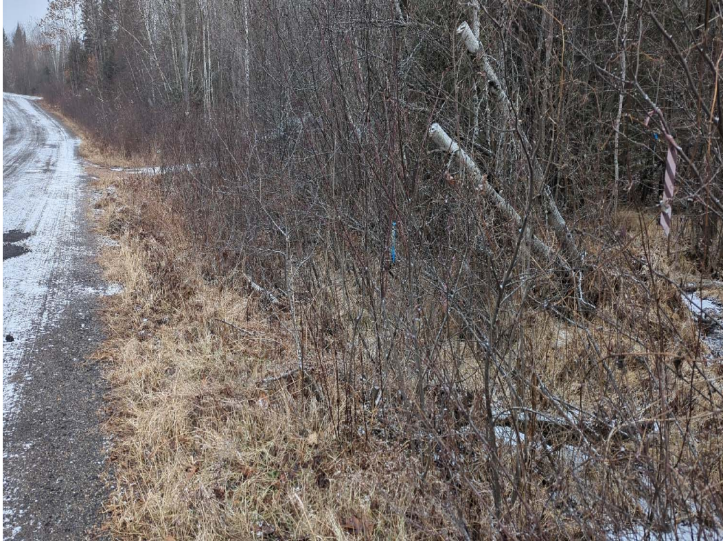
Photo 207. Location Number: 148 | Impact Areas: 23-6, 23-6a, 23-11, 23-12, and 23-13 | Capture Date: 1/4/2024