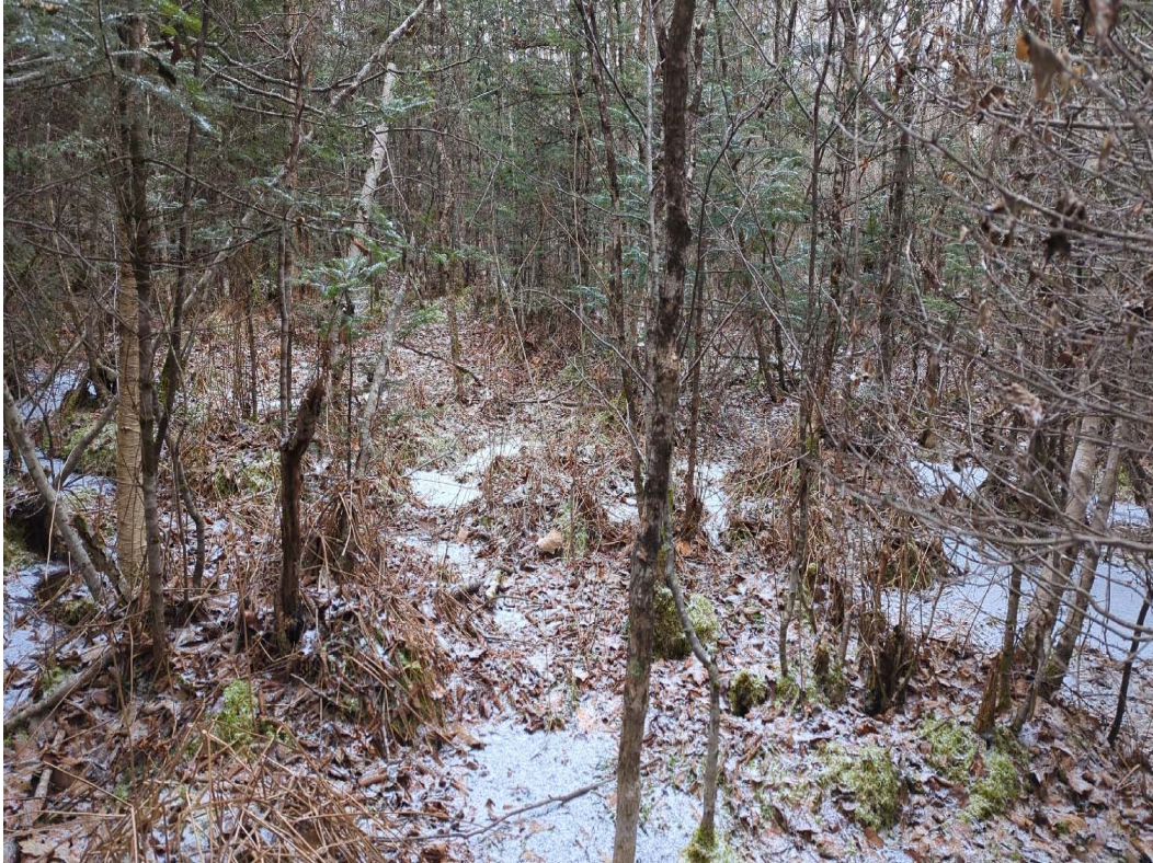
Photo 189. Location Number: 139 | Impact Areas: 22-25 | Capture Date: 1/4/2024