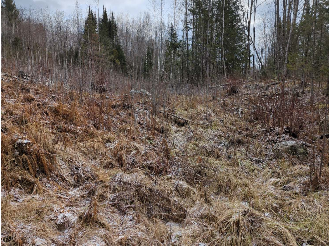
Photo 179. Location Number: 132 | Impact Areas: 22-21 | Capture Date: 1/4/2024