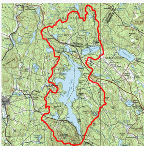
Lake Sunapee, Sunapee

Site Assessment: Riverway, Main St, Sunapee, NH