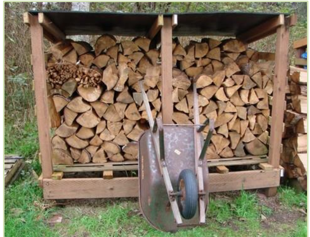
Proper Cordwood Storage Example

Please note that the use of fire starters made from paper, cardboard, sawdust, wax and similar substances is allowable to kindle the fire within the stove.