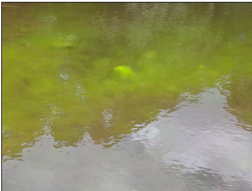
Subsurface masses of green filamentous algae

Filaments (commonly described as long hair-like strands) are usually found free-floating in masses that often carry other phytoplankton and microorganisms within it. They typically appear as bright neon-green, yellow-green when healthy or brownish-green as they decompose. The masses typically feel slimy to touch. Bundles of green filamentous algae have also been described as moving freely like a tumble weed throughout the water, as “cotton-candy-like” clouds hovering over the sediment near beaches, or found bubbling just under the water’s surface. This happens when strands of the hair-like algae stick together, often because of a mucilage they (or other associated algae) secrete, and gasses become trapped inside the masses, causing them to float up in the water column.