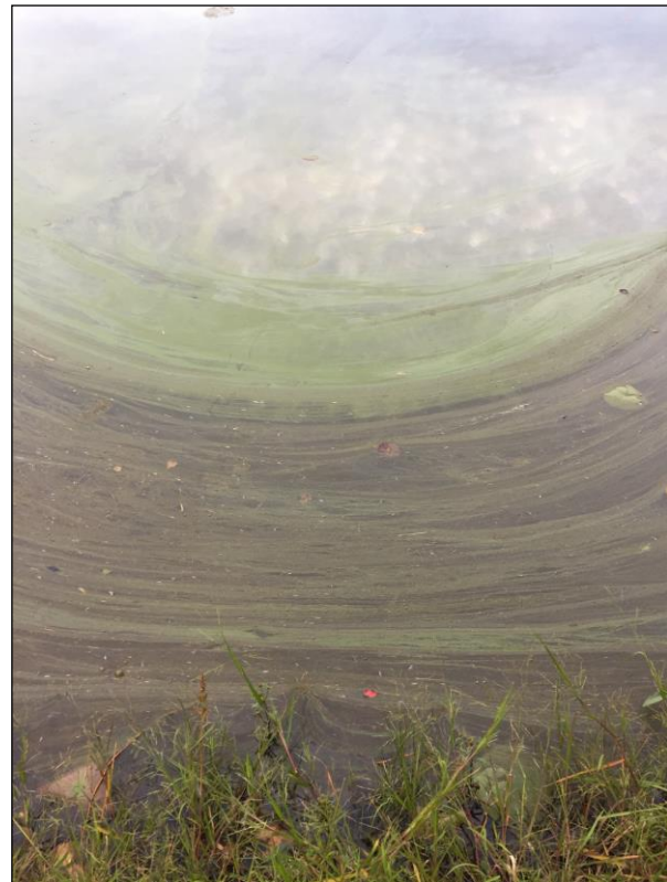
Strands of green filamentous algae (left) and ribbons of cyanobacteria accumulating nearshore (right).