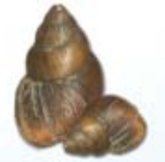
Chinese Mystery Snail